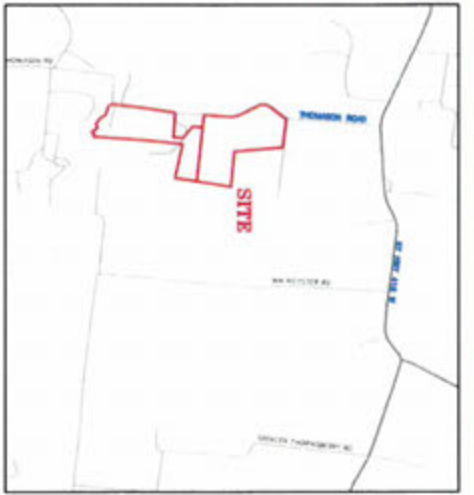
INSET MAP 1" = 2000 FT